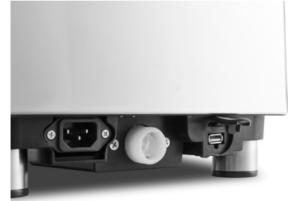
Water connection on all models

Customise your machine with the optional wooden kit which includes side panels, group handle, steam knobs and lever knob.